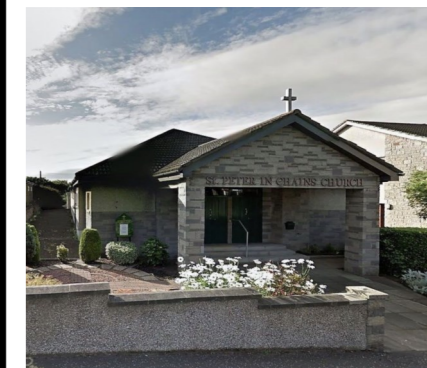
St Peter in Chain's Church, Inverkeithing

Contact details can be found on the back page.