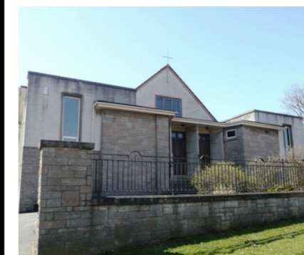
Our Lady of Lourdes Church, Dunfermline