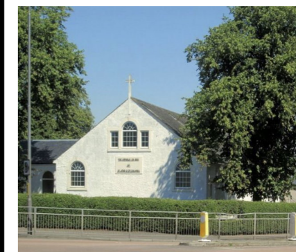
St John & St Columba's Church, Rosyth