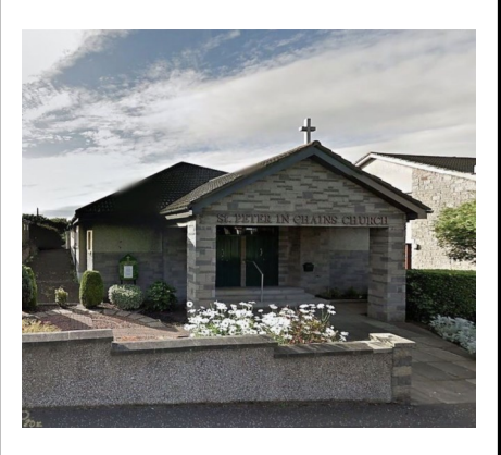
St Peter in Chain's Church, Inverkeithing

Contact details can be found on the back page.