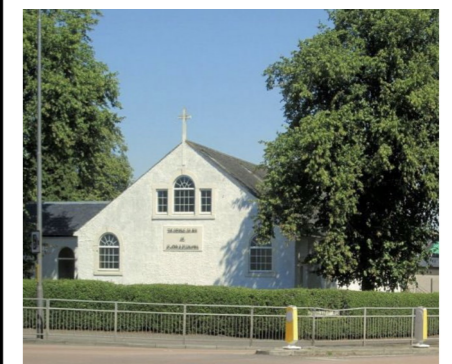
St John & St Columba's Church, Rosyth