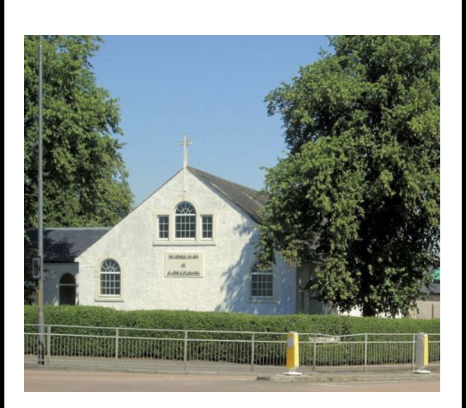
St John & St Columba's Church, Rosyth