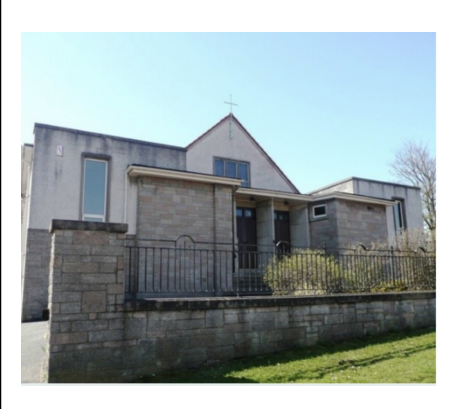
Our Lady of Lourdes Church, Dunfermline