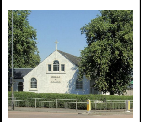
St John & St Columba's Church, Rosyth