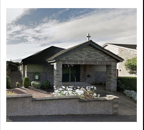
St Peter in Chain's Church, Inverkeithing

Contact details can be found on the back page.