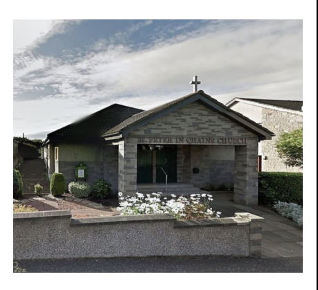
St Peter in Chain's Church, Inverkeithing

Contact details can be found on the back page.