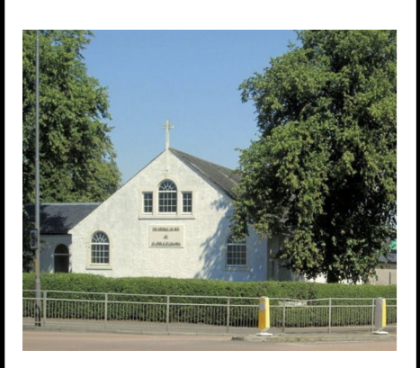
St John & St Columba's Church, Rosyth