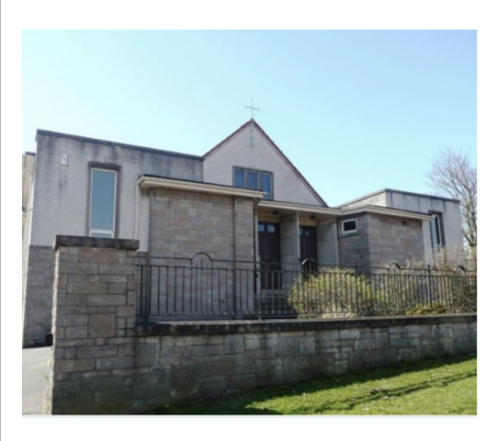
Our Lady of Lourdes Church, Dunfermline