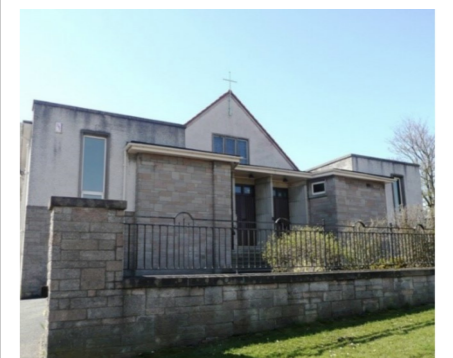
Our Lady of Lourdes Church, Dunfermline