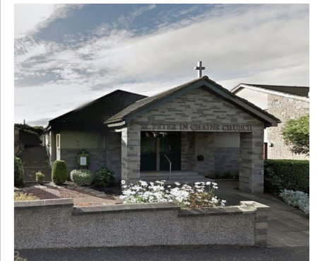
St Peter in Chain's Church, Inverkeithing

Contact details can be found on the back page.