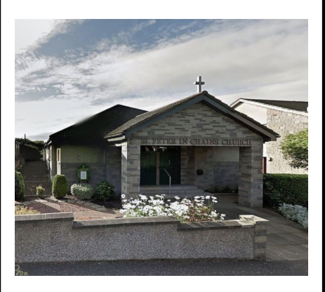
St Peter in Chain's Church, Inverkeithing

Contact details can be found on the back page.