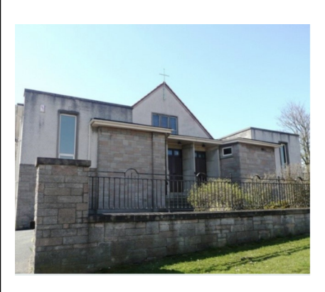
Our Lady of Lourdes Church, Dunfermline