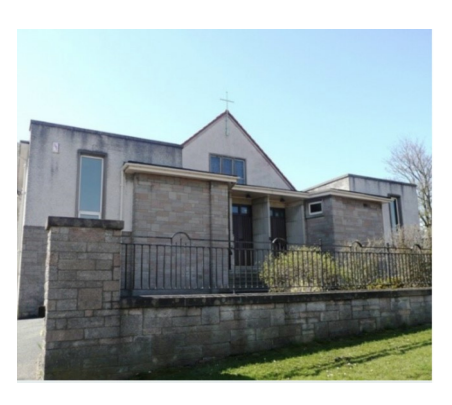
Our Lady of Lourdes Church, Dunfermline