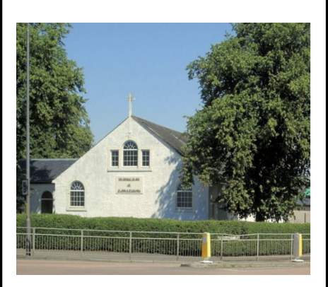
St John & St Columba's Church, Rosyth