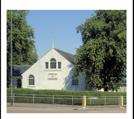
St John & St Columba's Church, Rosyth