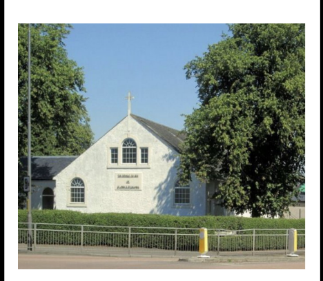
St John & St Columba's Church, Rosyth