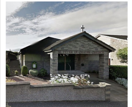
St Peter in Chains Church, Inverkeithing