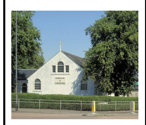
Ss John & Columba's Church, Rosyth