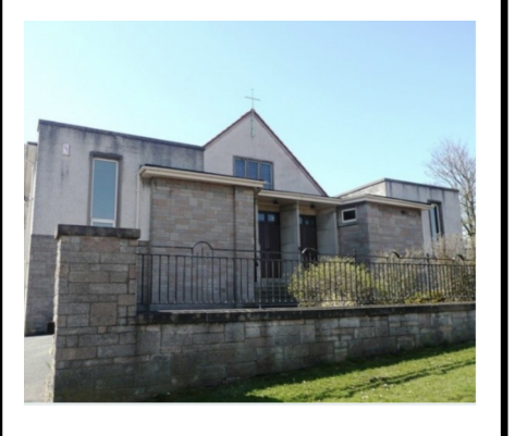
Our Lady of Lourdes Church, Dunfermline