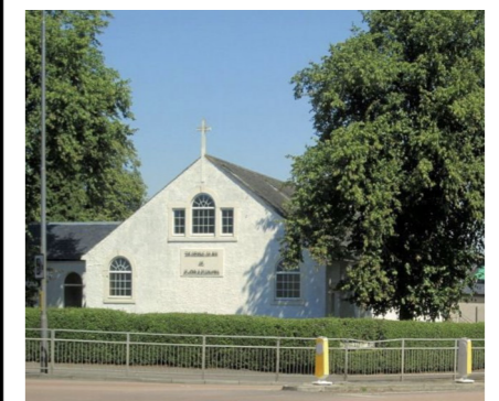
Ss John & Columba's Church, Rosyth