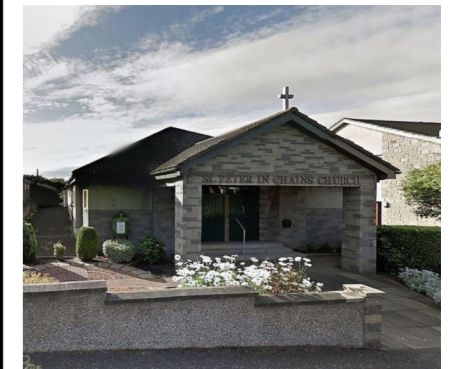
St Peter in Chains Church, Inverkeithing