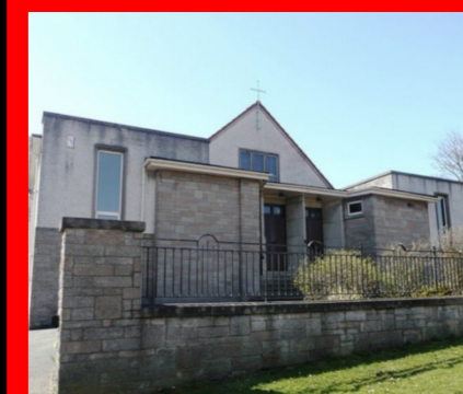
Our Lady of Lourdes Church, Dunfermline