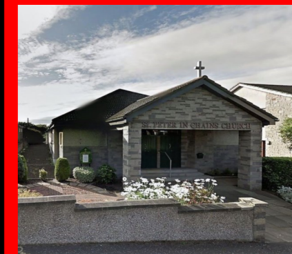
St Peter in Chains Church, Inverkeithing