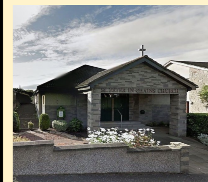
St Peter in Chains Church, Inverkeithing