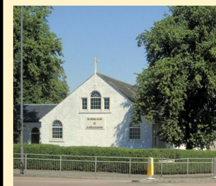
Ss John & Columba's Church, Rosyth