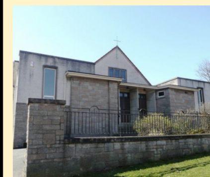
Our Lady of Lourdes Church, Dunfermline