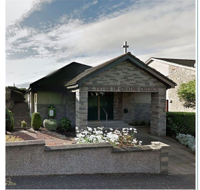
St Peter in Chains Church, Inverkeithing