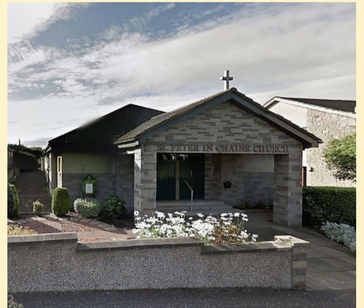
St Peter in Chains Church, Inverkeithing