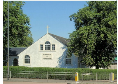
Ss John & Columba's Church, Rosyth