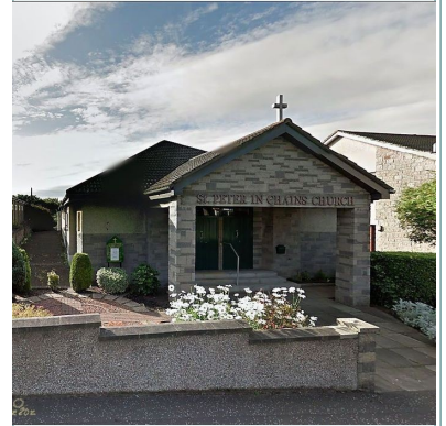
St Peter in Chains Church, Inverkeithing