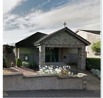
St Peter in Chains Church, Inverkeithing