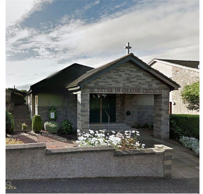
St Peter in Chains Church, Inverkeithing