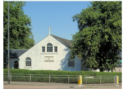
Ss John & Columba's Church, Rosyth