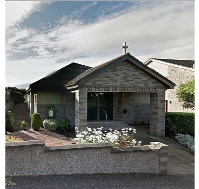
St Peter in Chains Church, Inverkeithing