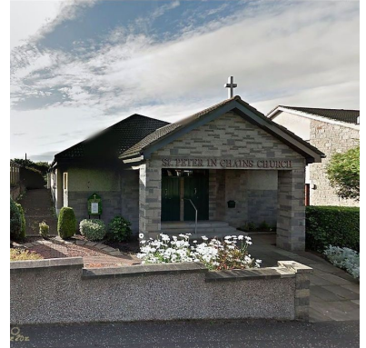
St Peter in Chains Church, Inverkeithing