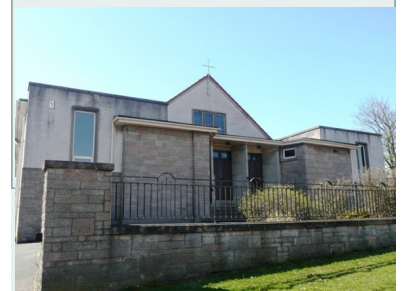
Our Lady of Lourdes Church, Dunfermline