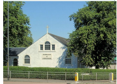
Ss John & Columba's Church, Rosyth