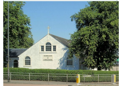
Ss John & Columba's Church, Rosyth