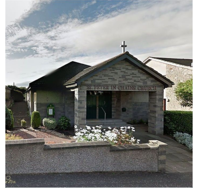
St Peter in Chains Church, Inverkeithing