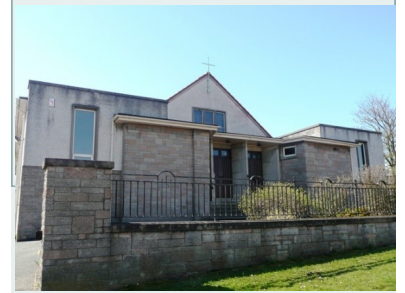
Our Lady of Lourdes Church, Dunfermline