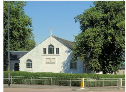
Ss John & Columba's Church, Rosyth