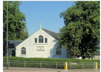
Ss John & Columba's Church, Rosyth