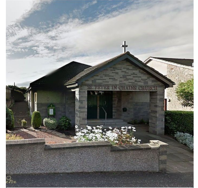
St Peter in Chains Church, Inverkeithing