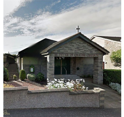
St Peter in Chains Church, Inverkeithing