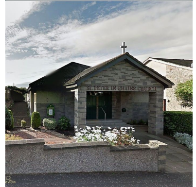
St Peter in Chains Church, Inverkeithing