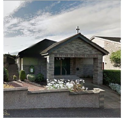
St Peter in Chains Church, Inverkeithing