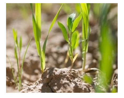
Some seeds bore grain that produced 30 times more